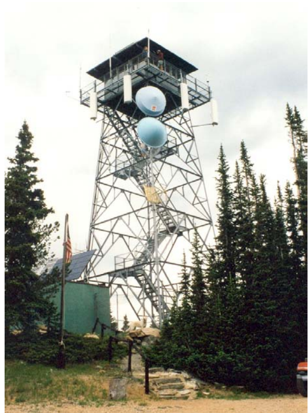
OVERALL VIEW OF DEADMAN HILL RADIO AND MICROWAVE SITE